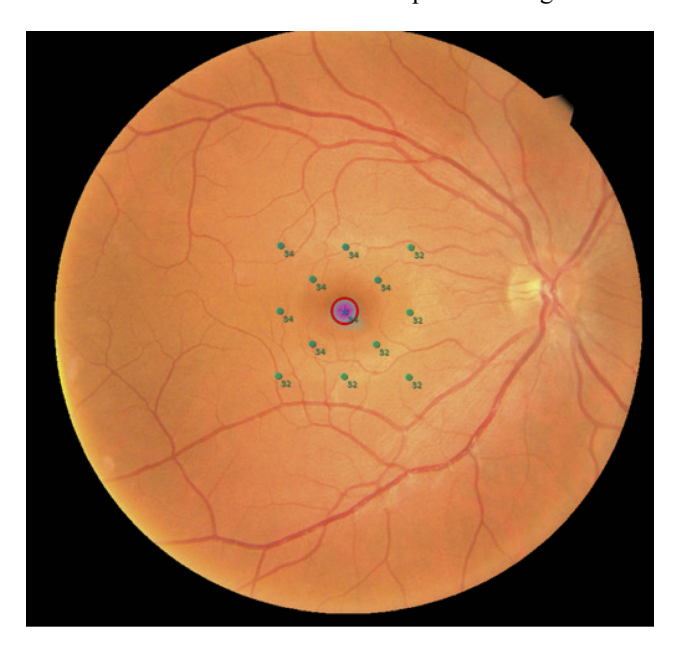
Figure 1 Real example of microperimetry performed for the study in a right eye. Microperimetric results of the right eye of a healthy subject. Retinal sensitivity is represented on the studied point in green color by a number and express in decibels.

Statistical analyses were performed using SPSS, version 22.0 (IBM, Chicago, USA). An alpha error of 5% was chosen. Continuous variables were plotted using t -student